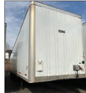
2011 Wabash Duraplate Trailer, Air Ride Suspension, Swing Door, Aluminum Roof, 8 New Virgin Tires, Stk #1038102.....$10,500