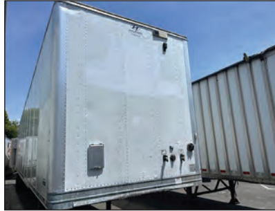
2018 Hyundai 53' Aluminum Van, Stk #1273964.....$19,500