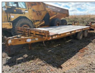
1996 Econoline SP623DE Trailer, Stk #1254035.....$5,000 As Is