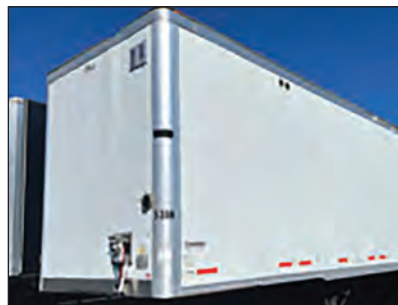
2015 Wabash 53' x 102" Duraplate Van Trailer, Air Ride Suspension, Aluminum Roof, Vertical Logistics, Swing Door, Stk #1230938.....$15,900