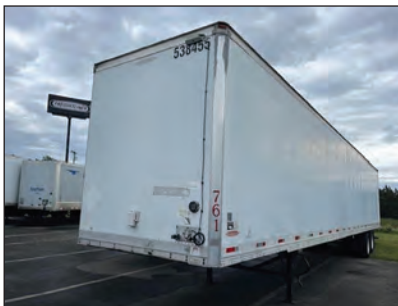
2008 Trailmobile 53' Aluminum Van Trailer, Translucent Roof, Stk #1035694.....$6,900