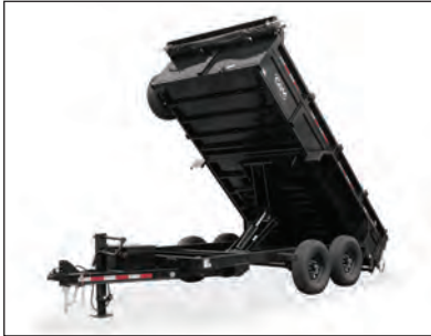
NEW 2026 Cam Superline Dump Trailer, Stk #1264911.....$14,900