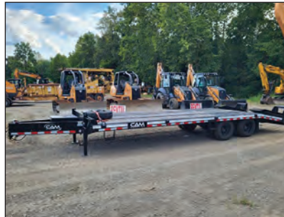
NEW 2025 Cam Superline P10CAM8205TE Deckover Trailer, Stk #1253840 .....$18,900