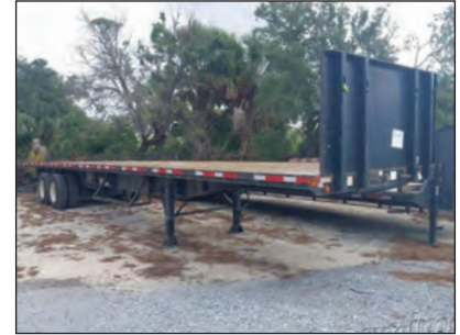
2014 Clark Flatbed Trailer, Stk #1263313.....$19,500