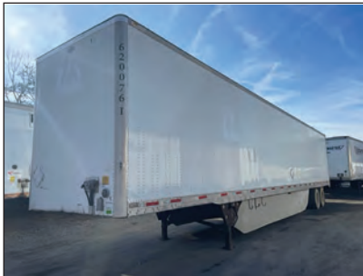
2013 Utility 53' Aluminum Van Trailer Stk #1155664.....$11,900