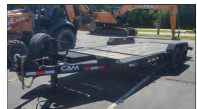
NEW 2025 Cam Superline P8CAM174STTXW Tilt Trailer, Stk #1253837.....$15,500