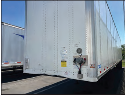
2018 Stoughton 53' Aluminum Van, Stk #1273965.....$19,500