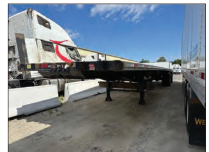
2016 Dorsey Flatbed Trailer, Bad Fifth Wheel/Upper Coupler, Stk #1083687.....$4,000 As Is