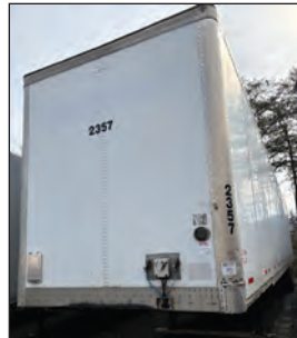
2012 Wabash Duraplate Trailer, Air Ride Suspension, Swing Doors, Galvanized Rear Frame, 8 New Virgin Tires, Stk #1049746.....$11,500