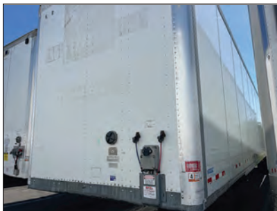
2017 Vanguard Nation 53' Aluminum Van, Stk #1273966.....$18,500