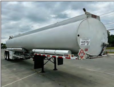
1990 Heil 42 x 96" 9,200 Gallon Tanker, Spring Susp., (5) Compartments - 2,500/2,100/1,000/1,500/2,100, Stk #1252512.....$19,500