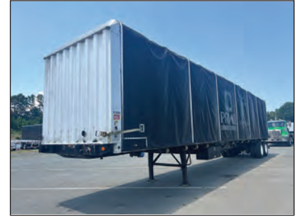
2005 Great Dane 48' Flatbed Trailer w/Aero Slide Tarp, (12) Winches, (10) Straps, Stk #1217024.....$12,500