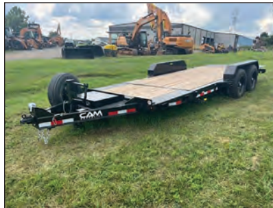
NEW 2025 Cam Superline P7CAM164STTXW Tilt Trailer, Stk #1253830.....$12,900